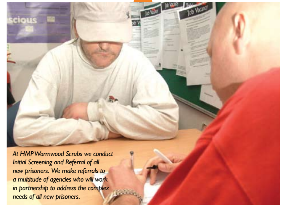
At HMP Wormwood Scrubs we conduct Initial Screening and Referral of all new prisoners. We make referrals to a multitude of agencies who will work in partnership to address the complex needs of all new prisoners.

The first night in prison can be a harrowing experience for prisoners, even those returning to custody. We work in partnership with other agencies to ensure that their needs are assessed promptly and the right level of support is provided.