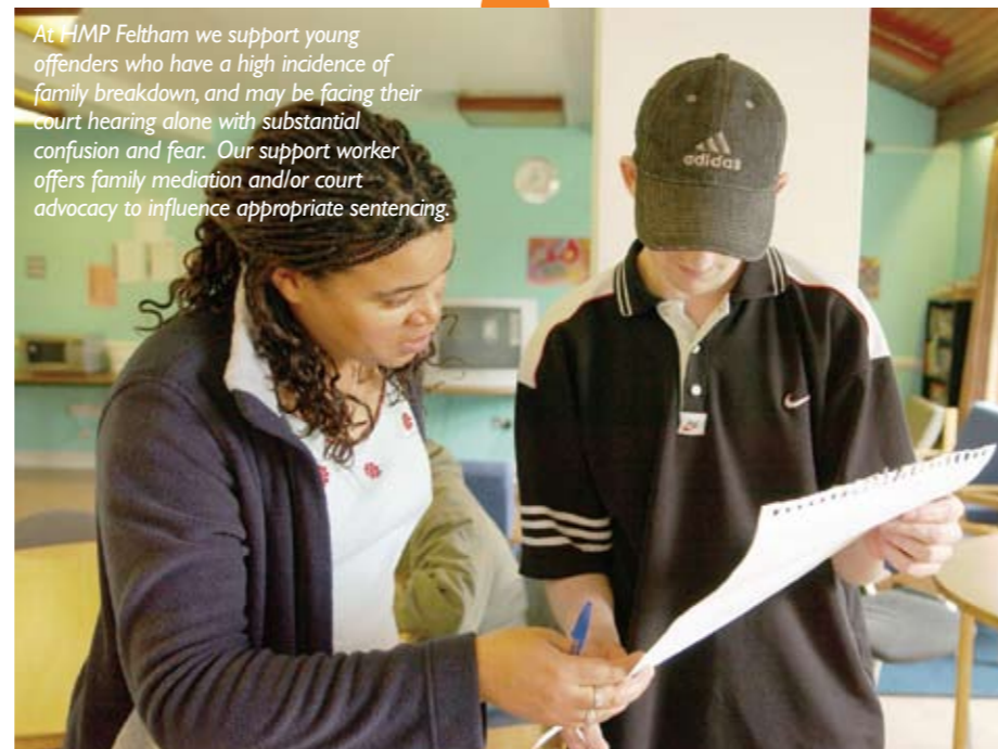
At HMP Feltham we support young offenders who have a high incidence of family breakdown, and may be facing their court hearing alone with substantial confusion and fear. Our support worker offers family mediation and/or court advocacy to influence appropriate sentencing.

We work with both remand prisoners and probation clients attending court hearings to advocate for our client's needs. We work closely with probation and prison officers to contribute to sentence planning often taking a lead on housing, health and work interventions.