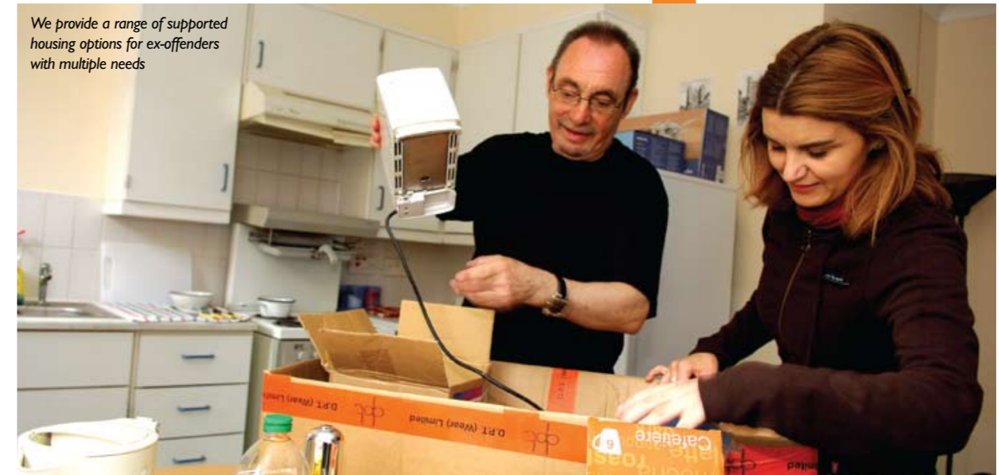
We provide a range of supported housing options for ex-offenders with multiple needs

Our Offender Learning project, (Exodus) in HMP's Wormwood Scrubs and Pentonville worked with around 230 prisoners to develop work and learning related goals and facilitating access to a range of education, training and employment opportunities in the community.