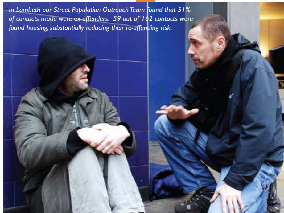
In Lambeth our Street Population Outreach Team found that 51% of contacts made were ex-offenders. 59 out of 162 contacts were found housing, substantially reducing their re-offending risk.

Our outreach services work with local police and community groups to assertively target offending behaviour on the streets of London. We also work with vulnerable adults with drug and/or mental health problems in police cells to facilitate support as an alternative to a custodial sentence.